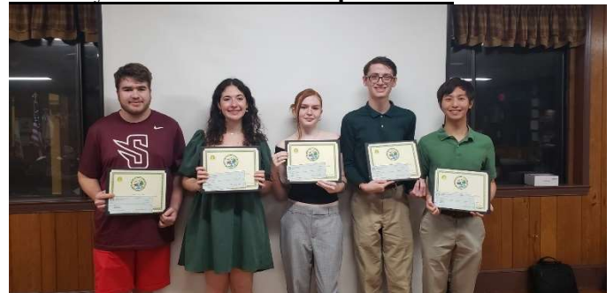
Left to right at the August GMM