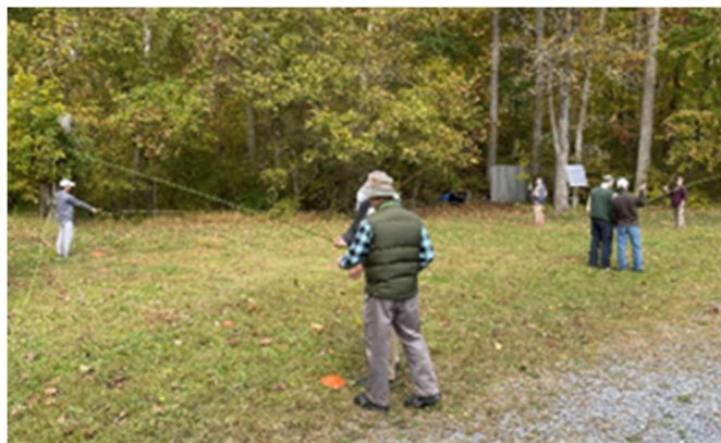
Students are getting one-on-one instruction in the art of casting a fly rod.